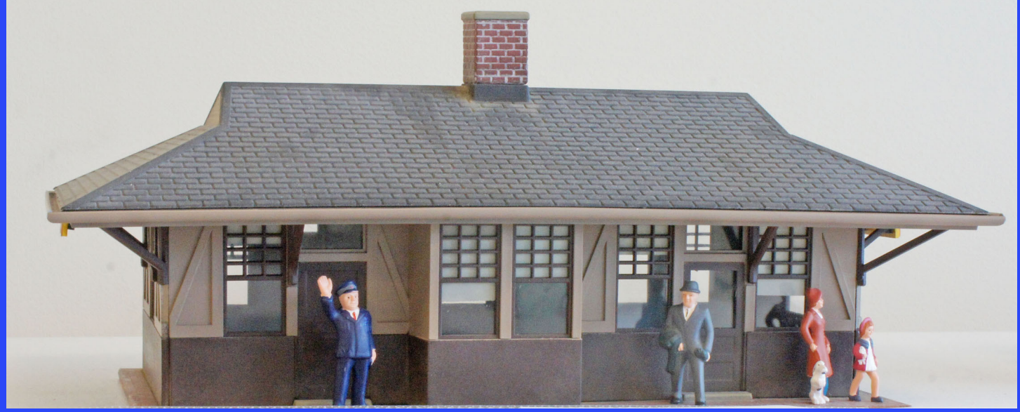
Editor's Model of the Month by Neal Schorr