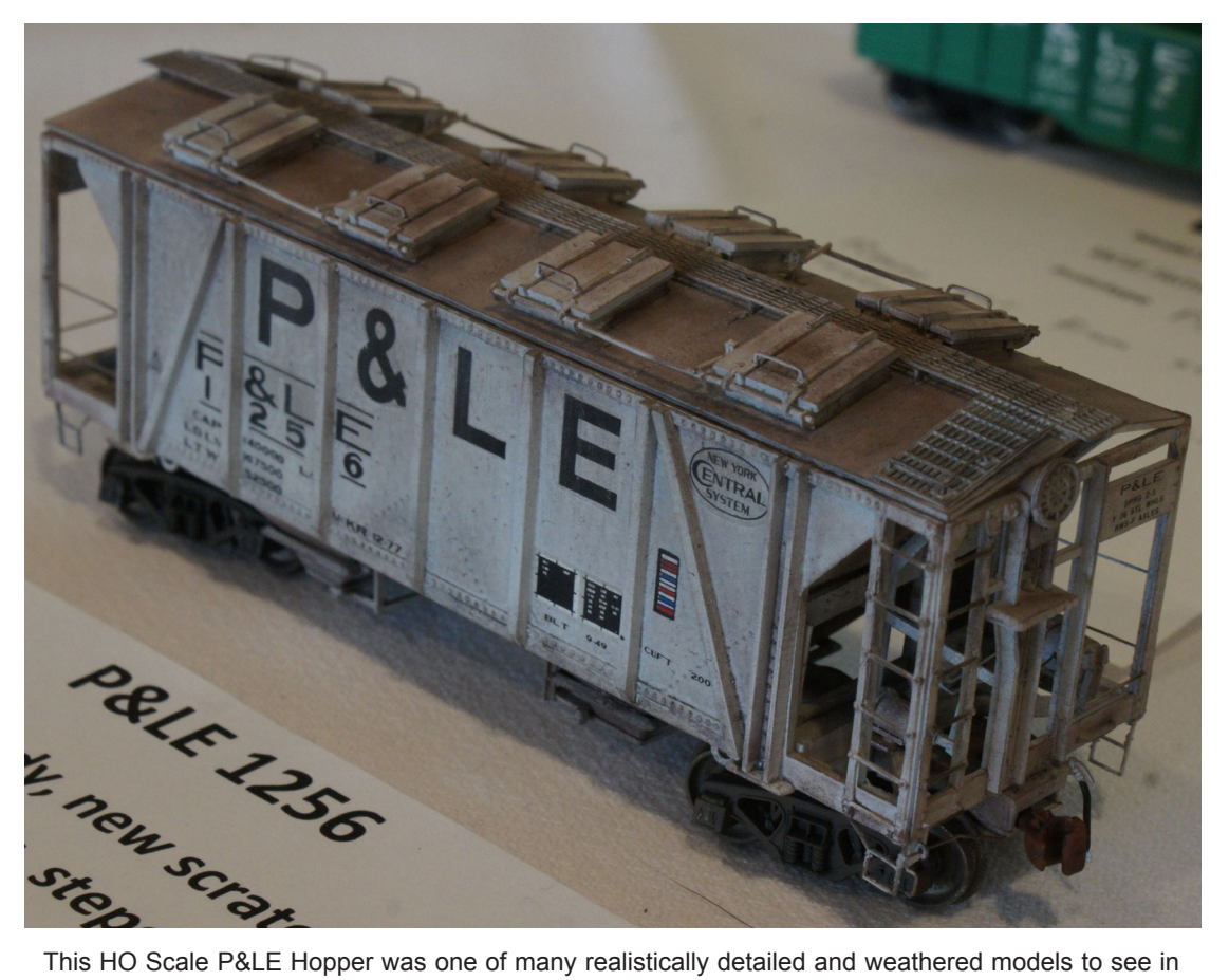
This HO Scale P&LE Hopper was one of many realistically detailed and weathered models to see in the model room at the Railroad Prototype Modelers meet in Greensburg in March this year.