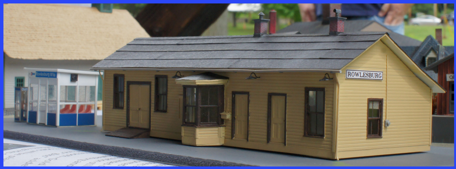
Editor's Model of the Month