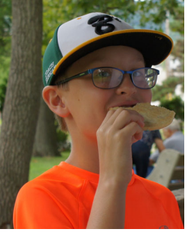
The modeler and his creation. Art imitating reality?