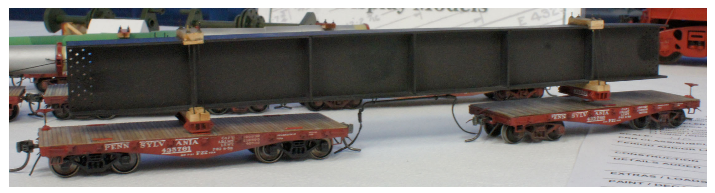
Closing out the PRR model-fest is this huge (by HO standards, at least) girder load. By the way, that was George Pierson's scratchbuilt model of the PRR passenger station at Port Royal pictured under Supt. Hohn's signature on Page 2.