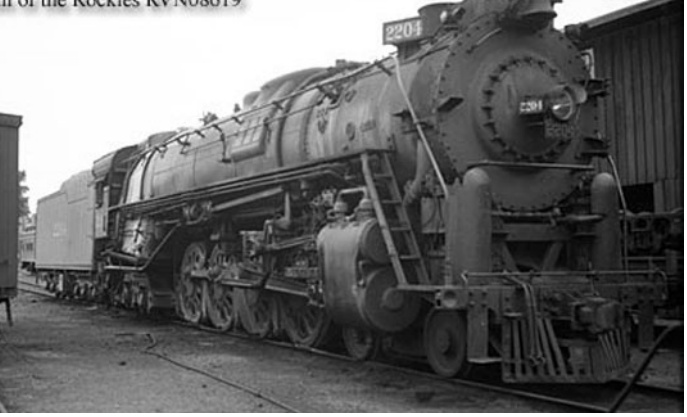
MoPac 4-8-4 No. 2204 was photographed on the shop tracks in Jefferson City, MO on July 25, 1940.

Whether by intent or not, a huge steam locomotive with spinning drivers is something best witnessed at a distance. m of the Rockies RVN08619