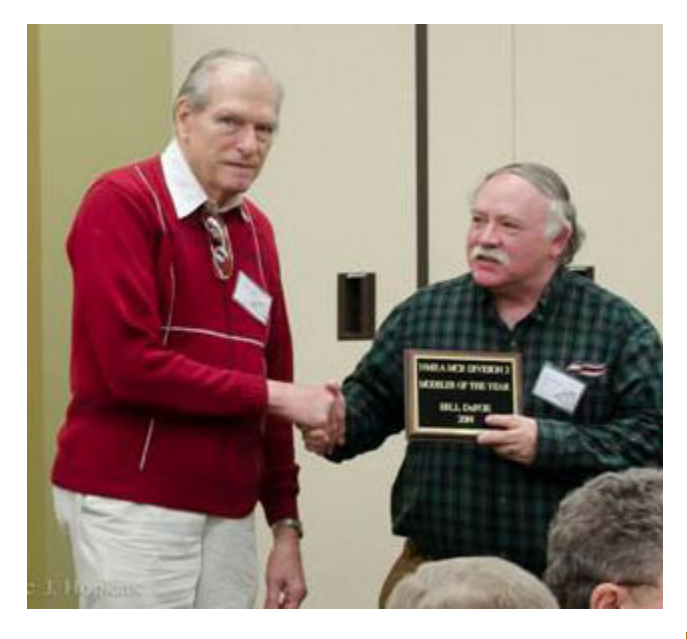
FROM THE MODEL ROOM at the Annual Meeting of the Pennsylvania RR Techncial & Historical Society