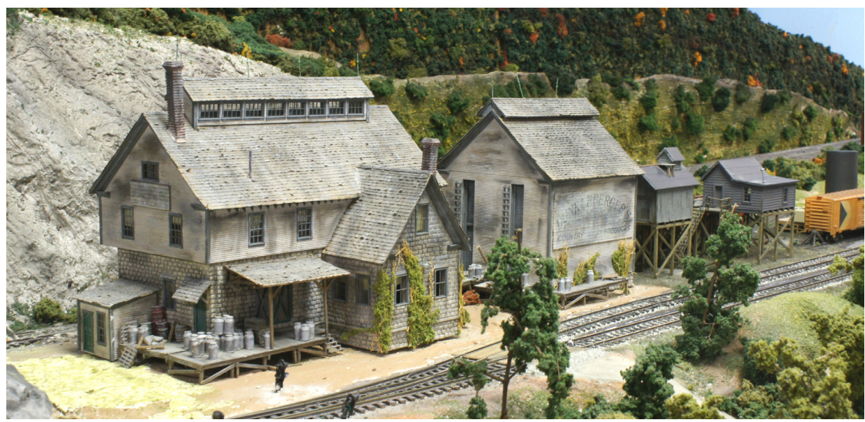
Scene on the Southbound Model RR Club in Durham, NC.