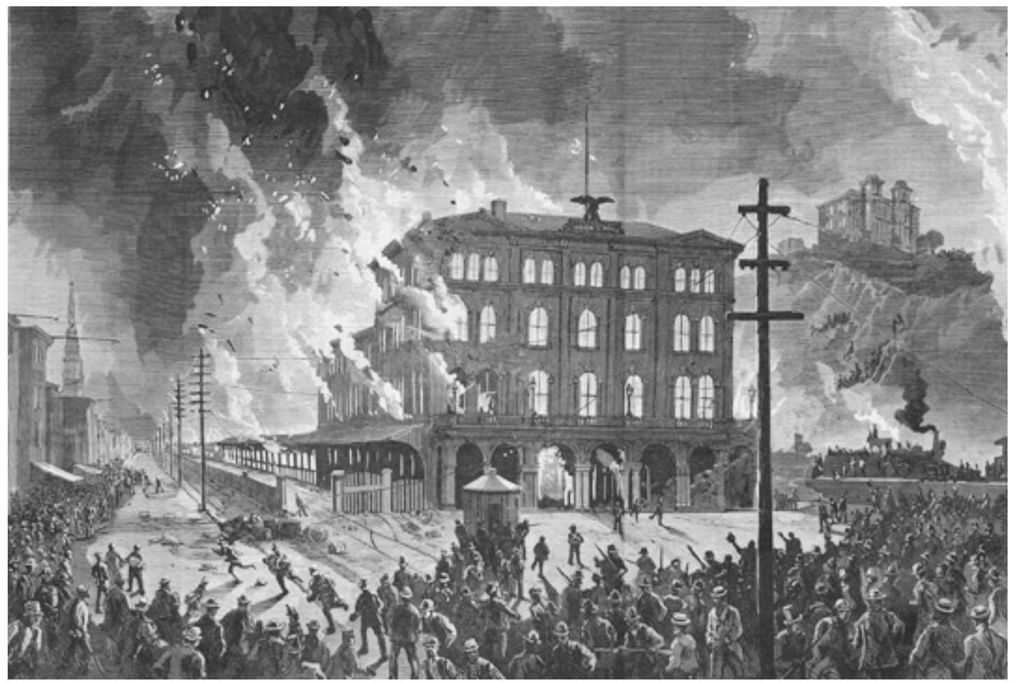
Apathetic (or incompetent) employees were unable to prevent a mob of disgruntled steam enthusiasts from torching the offices of the Huntingdon Northern Railway in retaliation for their annual Fall Foliage outing being destroyed by the appearance of diesels in their photo runby last October.