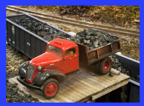
Model by Vagel Keller