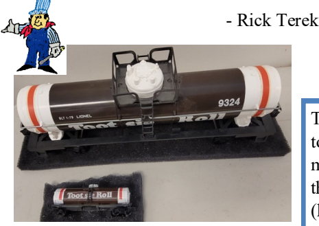
Two other cars were entered as well: a scratchbuilt logging flatcar (details overleaf), and this N scale tank car painted to match the whimsical Tootsie Roll tank car by Lionel (above).