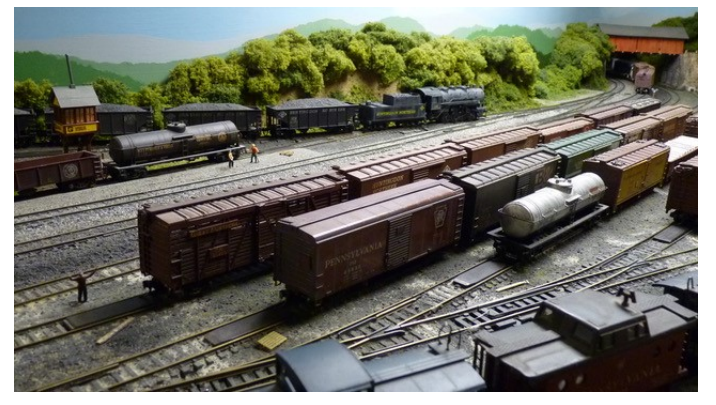
Spruce Creek Yard, with B&O interchange in background

A precedent-setting contract was also ratified during Robert's tenure that not only saved many jobs, but extended the life of steam locomotives into the late 1950s. Today, the railroad continues to do what it has always done; the Huntingdon Northern just moves large volumes of coal and merchandise over the mountains more cheaply than other carriers. Stay tuned for the next exciting and last chapter of the History of the Huntingdon Northern Railway!