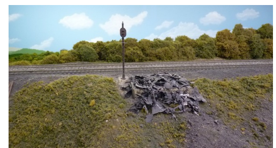
Remains of the train order office at Summit after BMLE labor action

Now the signals are used as both train order signals and manual block signals