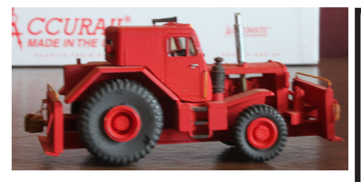
Another entry in the May B'n'B contest.