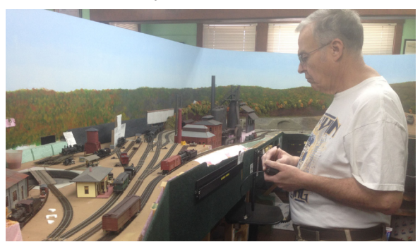
February 2015, Volume 57, Issue 2