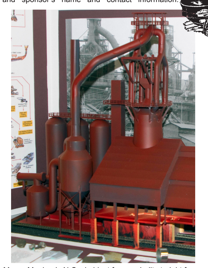
Marge Meehan's N-Scale blast furnace built straight from a Walthers kit and painted a red oxide color was the first place entry in this month's B'n'B contest.

Submissions welcome! Contact the Editor with announcements, including dates, times, location name and address, and sponsor's name and contact information.