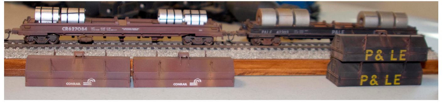
Grier Kuehn's nicely detailed and weathered coil cars, which took 2d place in the B'n'B voting this month. The steel industry is also featured on both of the club layouts to be open at our next two meetings.